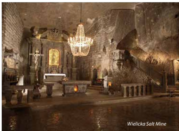
Wielicka Salt Mine

On the way back to Krakow, lunch will be served on board.